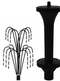
Double Volcano 7 1 / 2 " tall EFN4