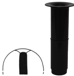
Water Bell 6 1 / 2 " tall EFN2