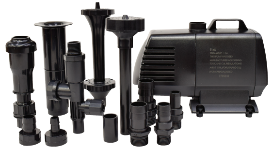
Components included with EP1350, fountains may vary

Thank you for purchasing the EasyPro Mag Drive pump. This pump is a magnetically driven water pump. It contains no oil, rotating shafts, shaft seals or bearings. This pump combines simplicity of design with the most energy efficient operation of any pump. All electrical components are encapsulated in epoxy. The impeller assembly consists of impeller blades attached to a magnet and is easily replaced should the need arise. There are threaded discharge and intake ports on all models.