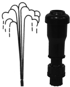
Foam Jet Swivel base, 5 3 / 4 " tall EFN1

See our website for videos of EasyPro Fountain Nozzles