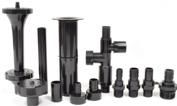
EP400 / EP600 (shown) EP400: no double volcano