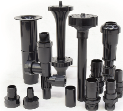
EP850/ EP1050 / EP1350 (shown) EP850 / EP1050 no foaming jet nozzle